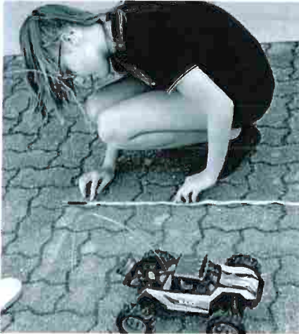
Measuring the braking distance

Students are investigating road science as a tangible way of studying Newton's Law. Currently students are designing and conducting experiments to investigate a factor that will affect the stopping distance of a vehicle. This could involve the type of surface, the speed of the vehicle, type of tyres and the mass of the vehicle. They will then write and produce a safety video related to road safety.