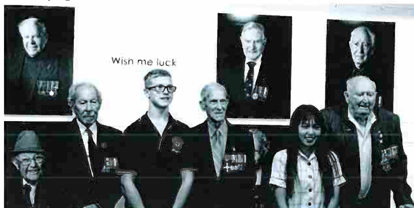
World War 2 Veterans pictured with Renmark High School Students