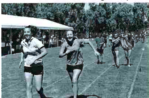
Students enjoying sports day