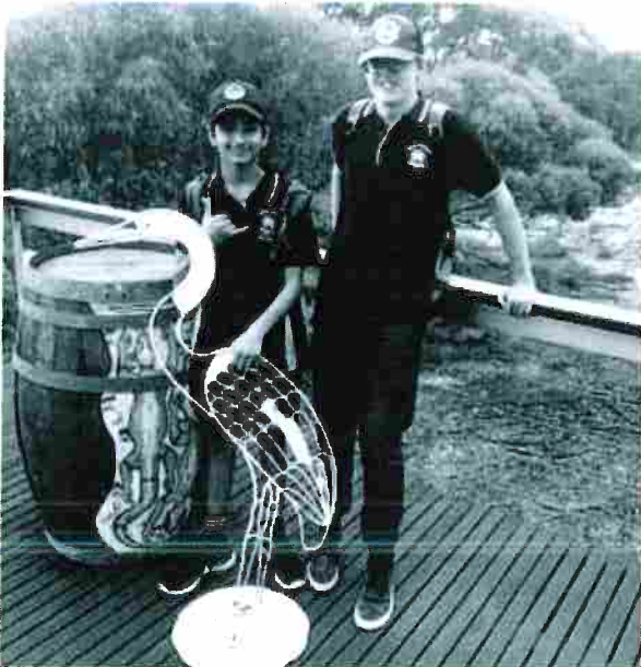
Welcome to Banrock Station