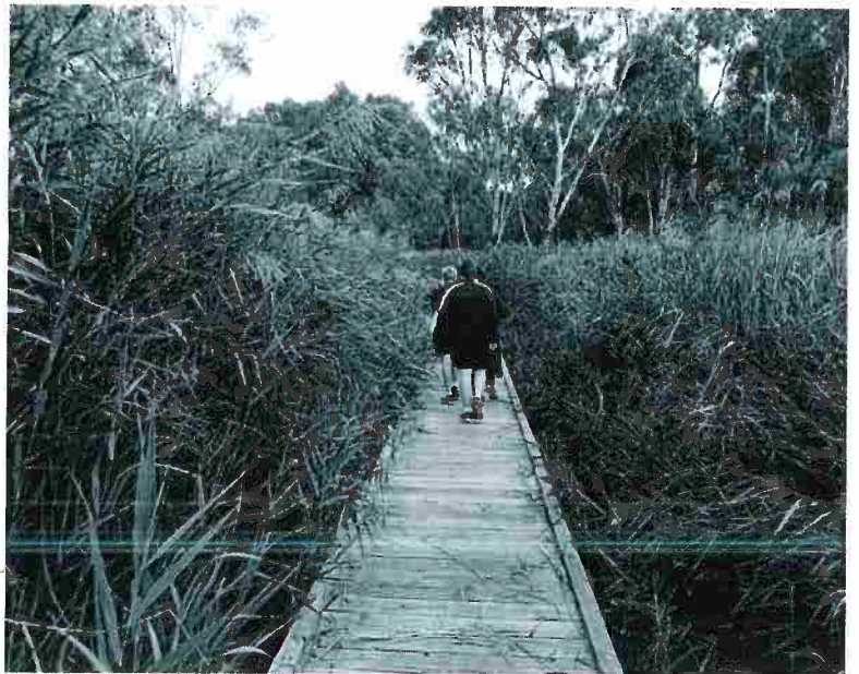
Banrock Station wetland walk