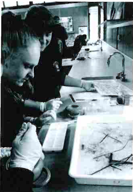
Students testing water samples at the McCormick Centre