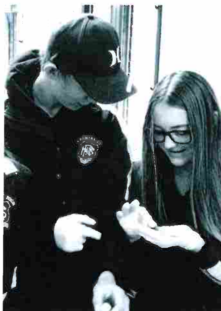
Students studying macro invertebrates at the McCormick Centre