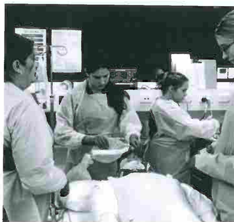
Students attending to mock accident victim