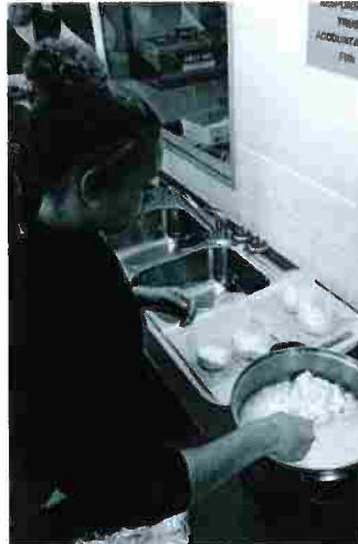
Curd ready for setting