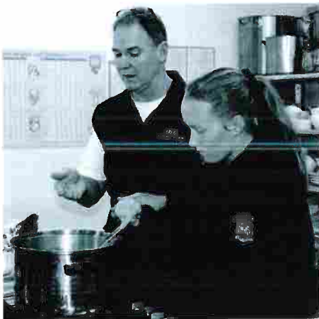
Incorporating bacterial culture