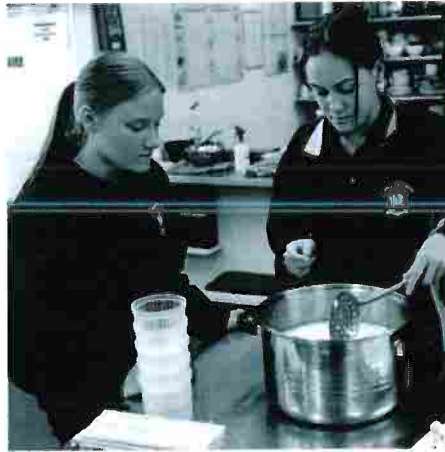
Cutting the curd