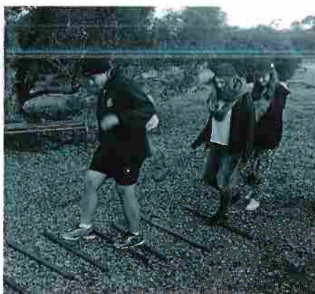
SRC Students participating in leadership and team building activities at Monarto Zoo