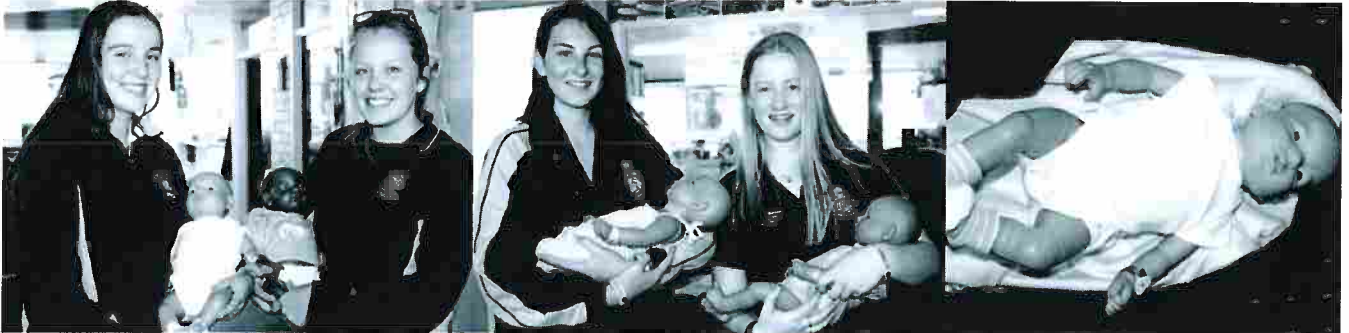
Virtual Babies are programmed to provide a real life parenting experience for students.