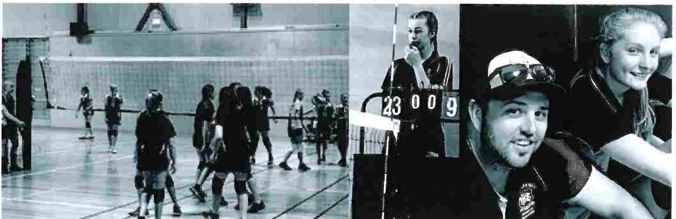
Moments from Heathfield