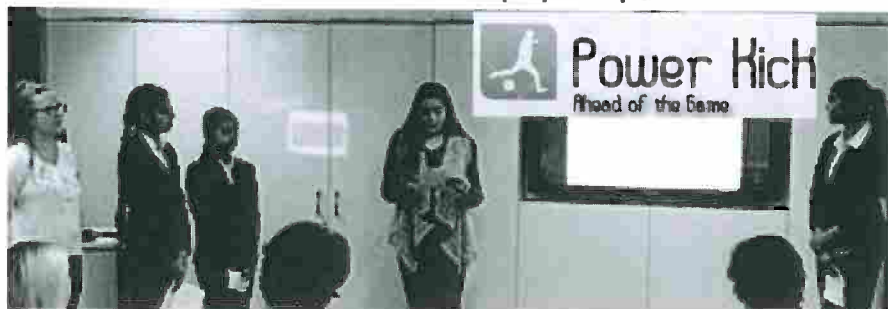
Power Kick making their presentation to the judges